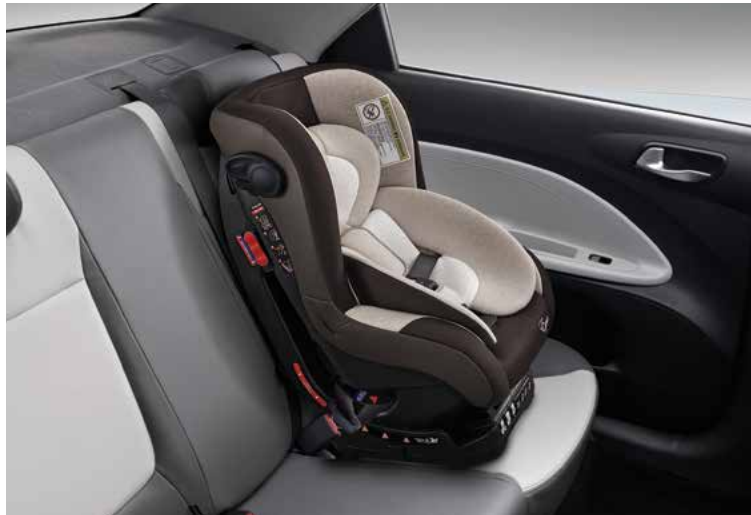
ISOFIX child seat anchors This feature is designed to securely hold child seats for maximum safety.