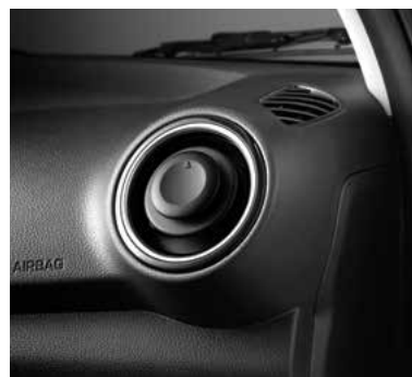
360° rotatable air ducts