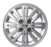
14-inch Alloy Wheel