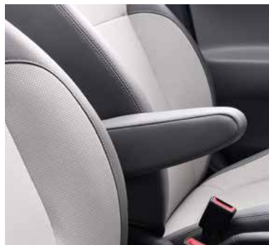
Driver's seat armrest