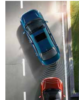
Parking distance warning-reverse

Using sonar technology, this system warns you when coming close to objects while backing into parking spots.