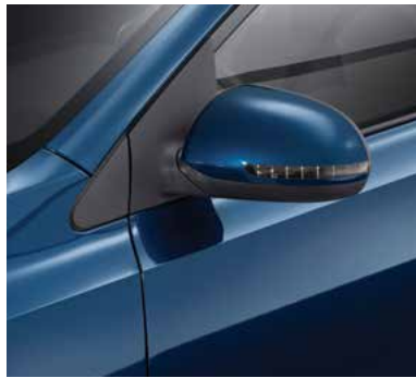
Electric adjustable outside mirrors with side repeaters*