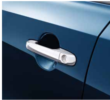
Chrome outside door handles*