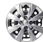
14-inch Steel Wheel

Seven enticing color choices and two striking wheel styles complement the bold, aerodynamic exterior design of the Pegas.