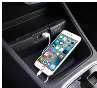
AUX & USB connection with 2-stage tray