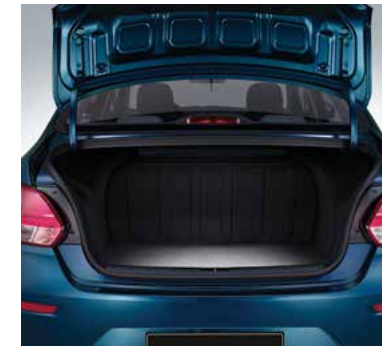
Illuminated luggage compartment