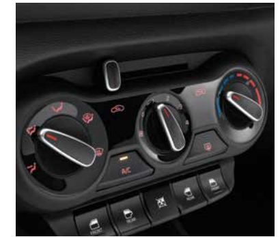
Manual temperature Controls