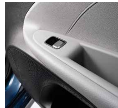
Rear door power windows