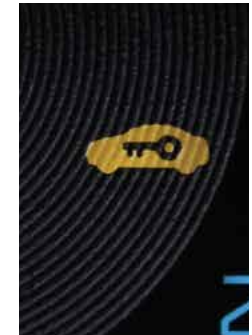
Immobilizer Anti-theft technology prevents the vehicle from being operated by unauthorized people.

Using sonar technology, this system warns you when coming close to objects while backing into parking spots.