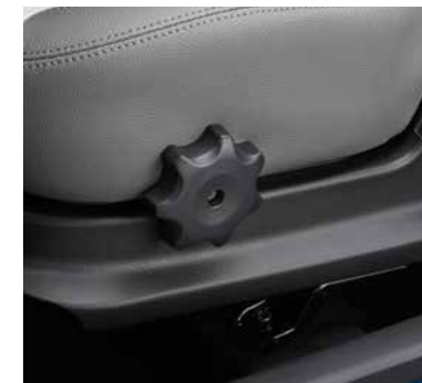
Driver's seat cushion tilt*