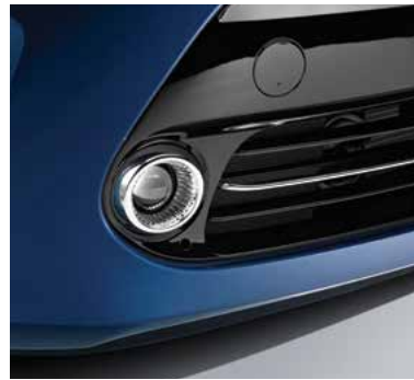
Projection fog lamps*