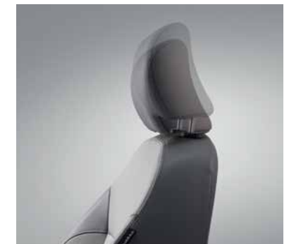
Height adjustable front seat headrests