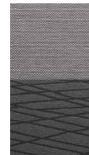
Gray Two-tone Cloth