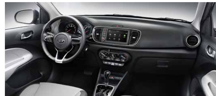
Black One-tone Interior