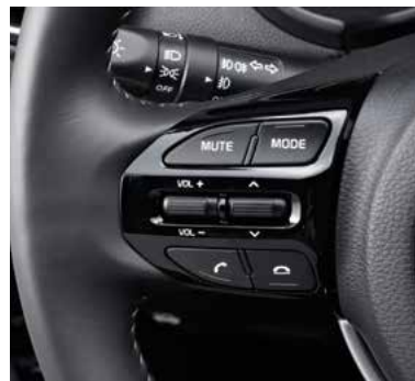
Audio remote control