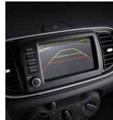
Rear view monitor with parking guidance

See your path as you back up thanks to guide lines on the center display that help you safely maneuver into tight spaces.