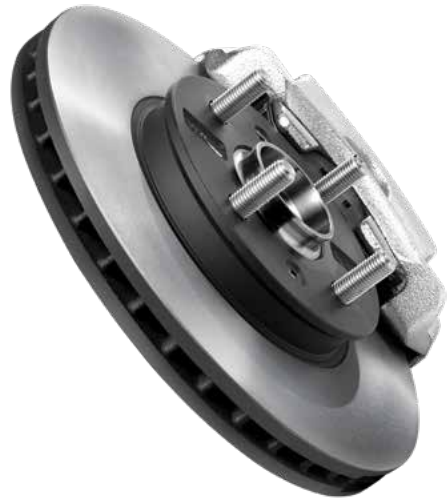
4-wheel disc brakes Disc brakes help you stop faster with more control.