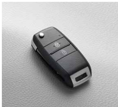
Remote key central locking